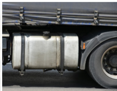
Side Tank Cover