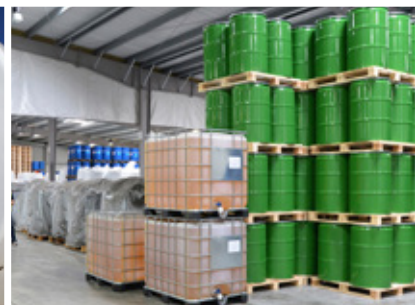
Warehousing and Manufacturing