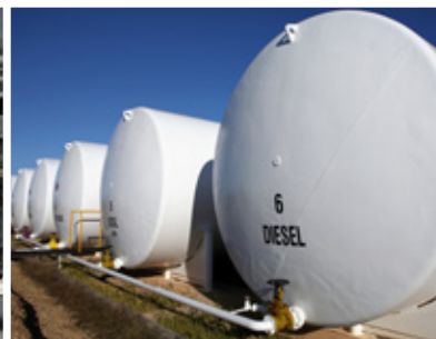
Above-ground and Underground Storage Tanks